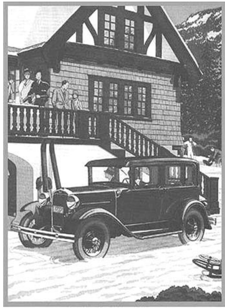
The New Ford Town Sedan